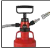
Attach quick disconnects to the accessory port. (not included)