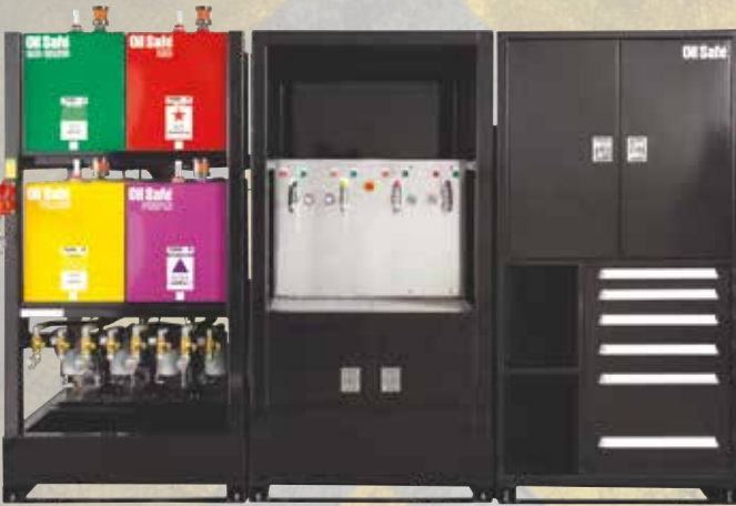
SHOWN: LUBRICATION WORK CENTER SYSTEM (#FF30400) W/ STORAGE CABINET (#FF90150)

The two main systems are the Advanced and the Lubrication Work Center . Each can be configured to meet your specific workplace requirements. Additional secondary systems are available to supplement lube management either in the field or in other areas of the workplace.