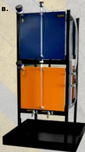
SHOWN: (A.) CUSTOM LUBRICATION STORAGE ROOM, (B.) CUSTOM BULK SYSTEM BUILD