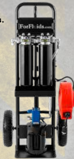
SHOWN: (A.) CUSTOM PANEL UNIT - #FFPUDC, (B.) CUSTOM HIGH PERFORMANCE FILTER CART - #FFHTDC