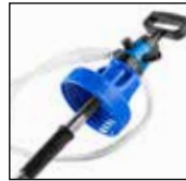
Unscrew the Utility Lid cap to attach a pump of your choice and draw from a drum.

(Oils) 5 Gal. Pails/OS Drums FFBP20-K (Oils) 16 to 55 Gal. Drums FFBP60-K